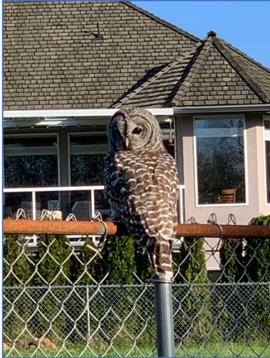
Hootie the resident owl

TOTALS for October vs AVERAGES (April to October)